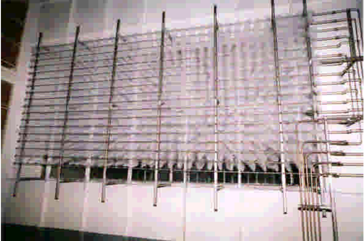
Figure A ” Typical Large Turbine Inlet Fog Cooling Array